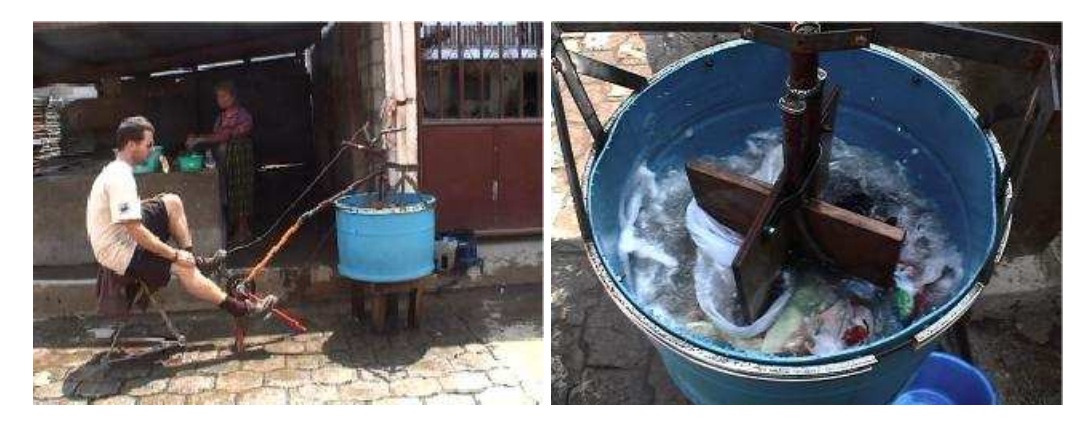
Figure 2: MayaPedal's prototype washing machine shows that demand exists, but it is difficult to use and it damages clothing.

In the past, MayaPedal attempted to make a pedal-powered washing machine from locally available materials, but it was unsuccessful. They built a prototype with a vertical axis agitator(See Figure 2), but it did not wash clothes well, it did not have spin dry capability and it consumed a great deal of water. Although MayaPedal recognizes the demand for pedal-powered washing machine, it does not have the resources or time to design, prototyping and refine a new device.