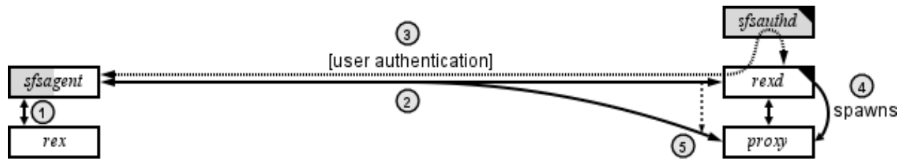
Figure 1: Setting up a REX session (Stage I)