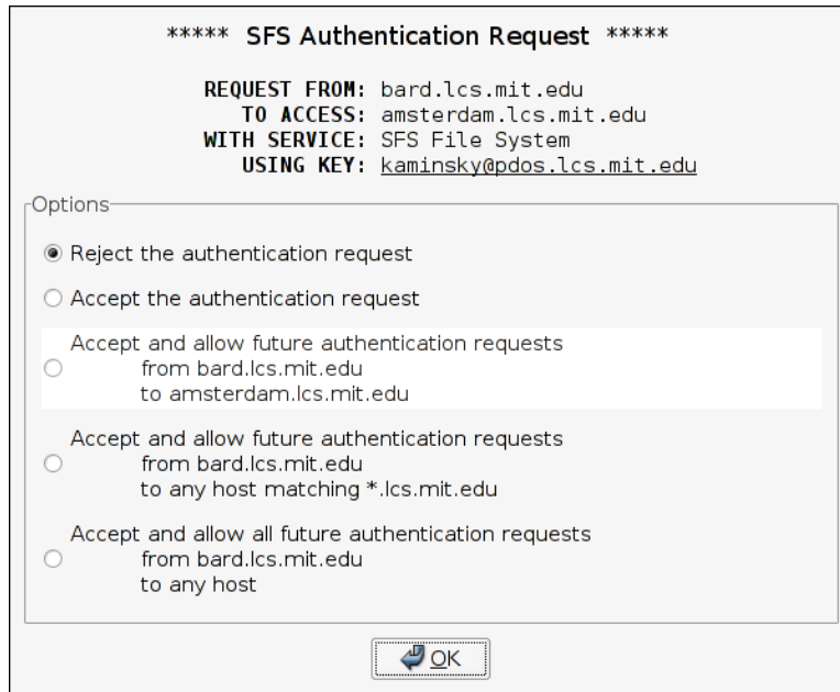
Figure 4: A GUI confirmation program

server” program, sfsd , can proxy TCP traffic to different internal IP addresses based on the contents of the initial CONNECT RPC. Port sharing with sfsd is similar to using the HTTP Host header with an HTTP proxy.